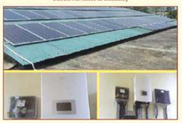
Solar Power Plant ,Bhattadev University,Bajali