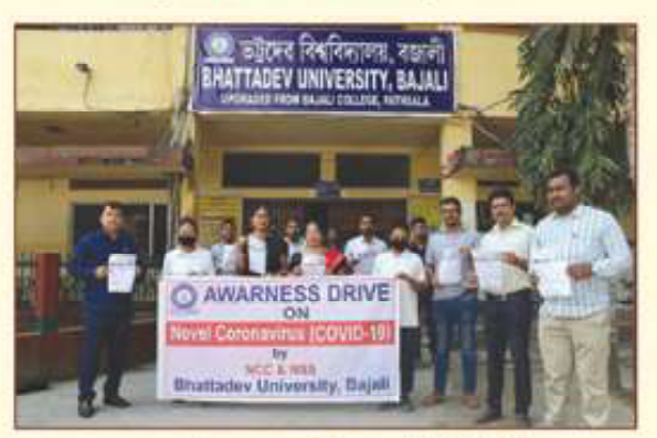
Awareness drive on COVID-19