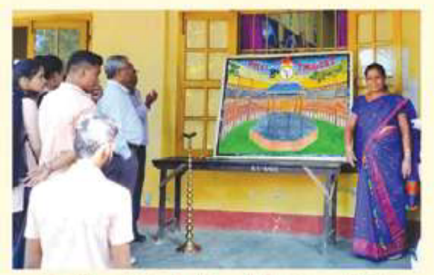
Unveiling of 'Wheel of Thought' by Honorable VC