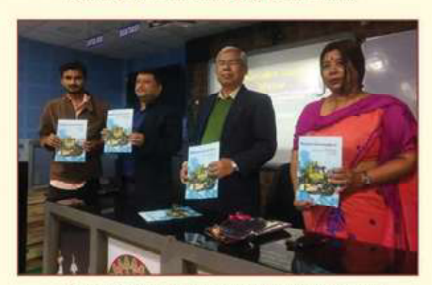
Inauguration of 'Bhattadev University Mirror'