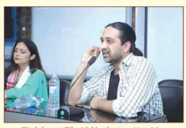
Workshop on Film Making by team 'Aamis'